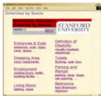
(b) OntoView by Semio