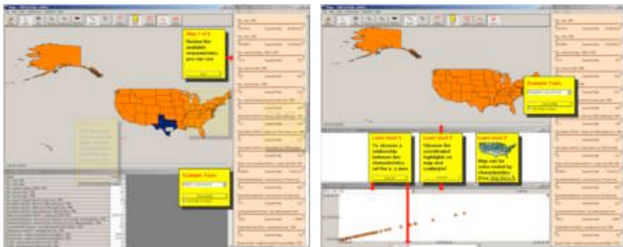
Figure 2: Two examples of IIG sticky notes. The left example (a) corresponds to a serial grouping of sticky notes. It shows the series of steps to accomplish a task. The right example (b) shows the sticky notes representing separate or “parallel” features in a level of the interface.

Our first IIG implementation (see examples in Figure 2) was improved iteratively while we collected feedback from 12 users. An informal think-aloud procedure was followed. Users were given neither demonstration nor specific instructions but only some context for the situation: “Imagine that you are considering moving elsewhere in the US and are looking for information about states to decide where you might want to live. You went on the web and found this site at the census bureau”. After they explored the site for about 20 minutes they were interviewed in more detail, then shown the other interface and asked to comment on what they liked and didn’t like about the two interfaces.